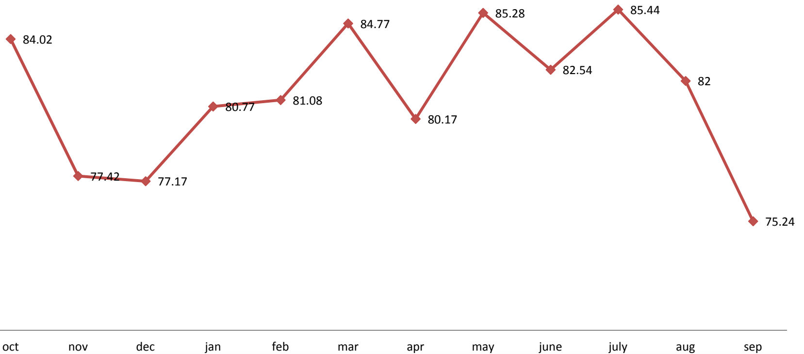
Timeliness of med administration FY11